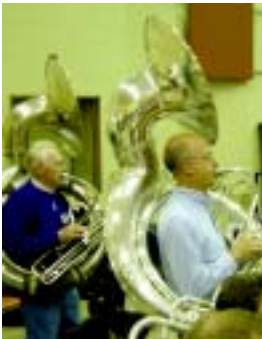
Friday night music rehearsal Homecoming parade