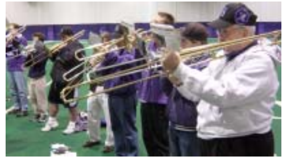
Saturday morning music and marching rehearsal in the indoor practice facility at Ryan Field